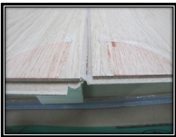
Recovered Swell (Disassembled)

Samples and their identifying descriptions have been provided by the client unless otherwise stated. NZWTA Ltd makes no warranty, implied or otherwise as to the source of the tested samples. The above results are designed to provide THE CLIENT WITH GUIDANCE INFORMATION ONLY. This document shall not be reproduced except in full.