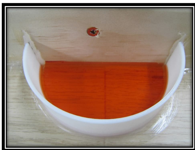
24 Hrs with Water